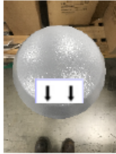
* Note arrows for light direction if assymetric distribution