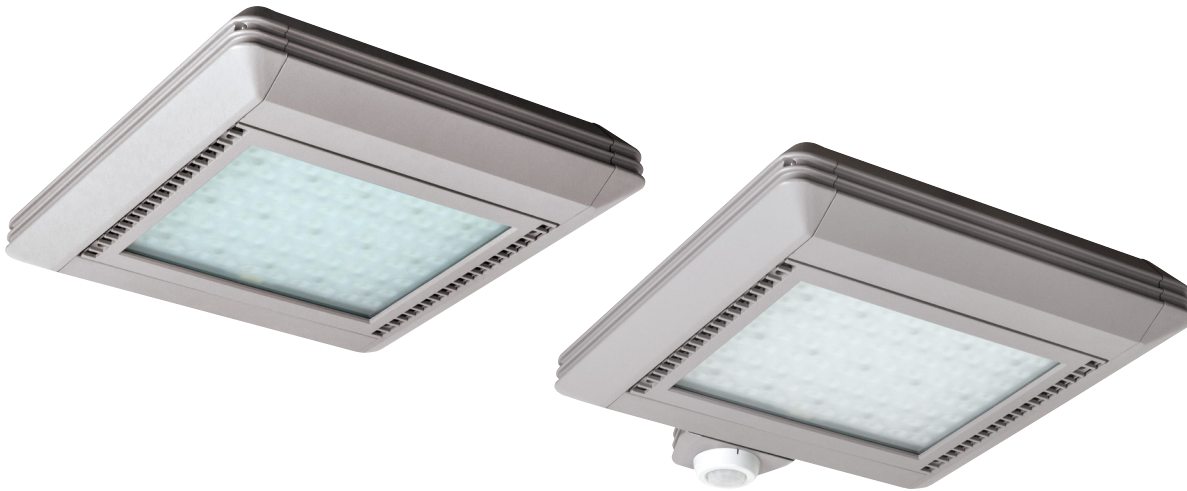
SFC canopy/ceiling luminaire