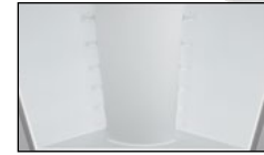
Air return model

The Alkco EvoSeal is designed to meet the needs of modern specialty and healthcare lighting. The opal diffuser softens even high lumen outputs, and the bottom lenses protect the fixture from environmental ingress or abuse. Efficient 90 CRI AccuRender LEDs with optional Tunable White and cyan-enhanced BioUp technologies keep human-centric lighting in mind.