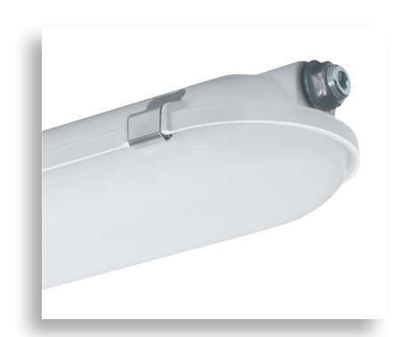
LFA - smooth frosted acrylic lens