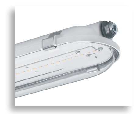
Standard clear lens