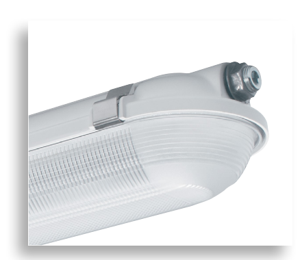
WHP - Wide beam optic and prismatic acrlyic lens